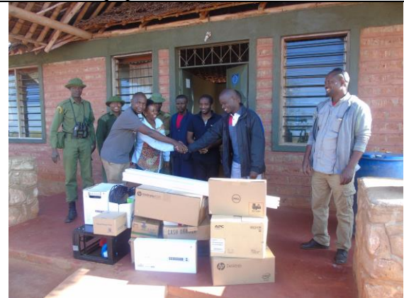
Desks Donations to Murugua school